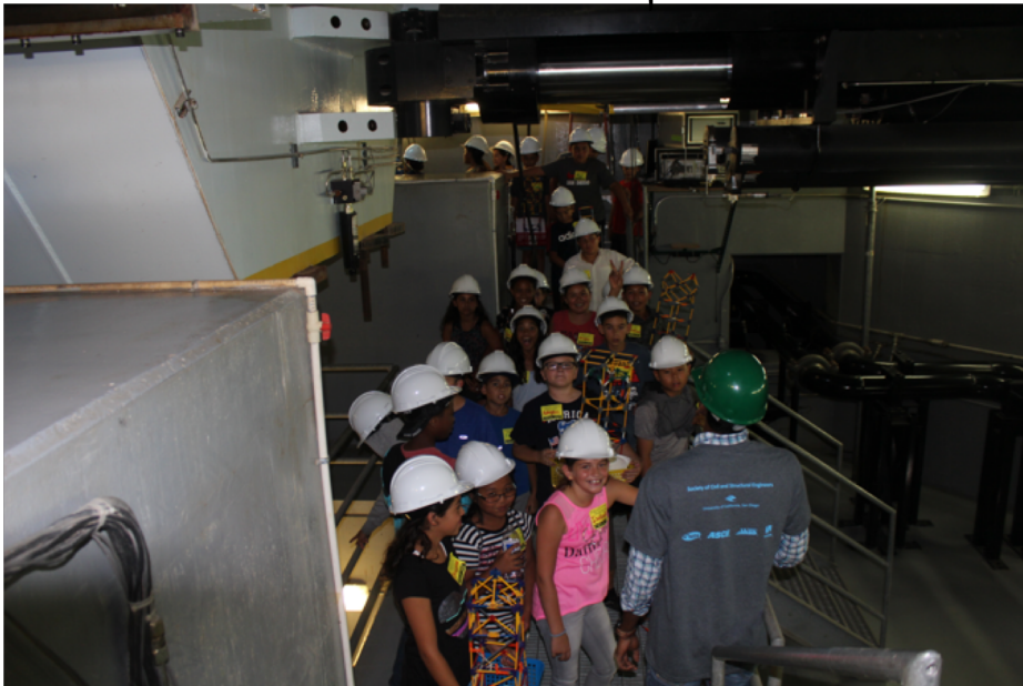
Rotation 3: Tour of facility below ground