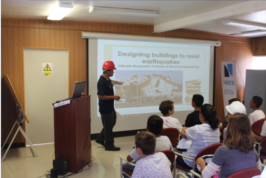
Rotation 1: Videos of past tests