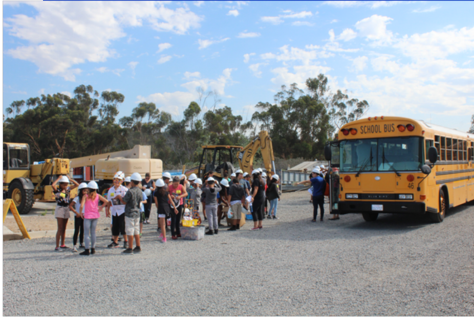
Kids arriving, checking in, safety meeting.