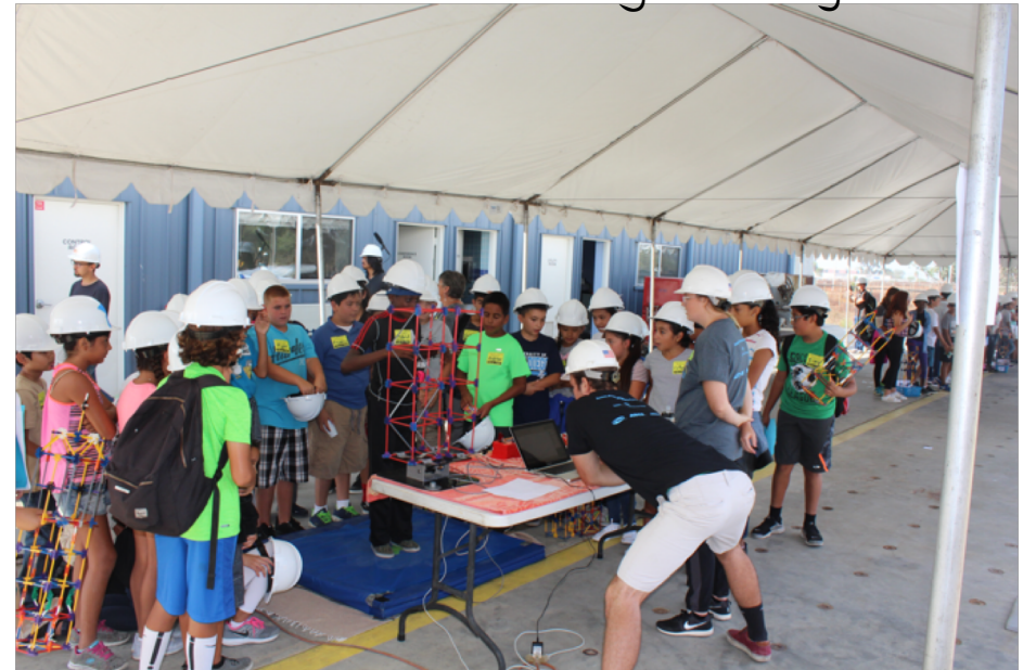
Rotation 4: Make Your Own Earthquake