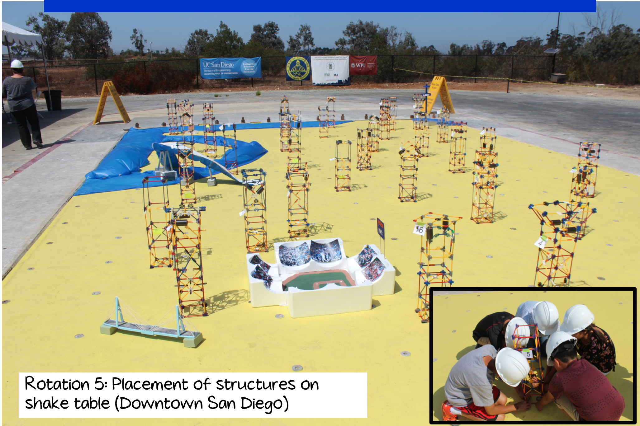
Rotation 5: Placement of structures on shake table (Downtown San Diego)