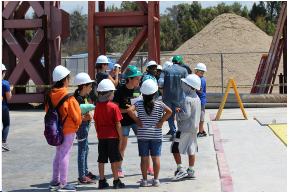
Being interviewed about their designs