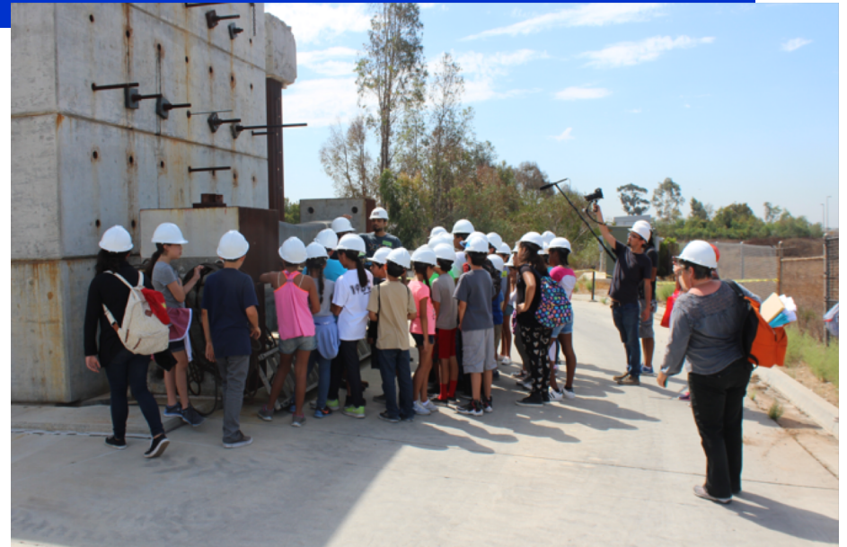
Rotation 2: Tour of facility above ground